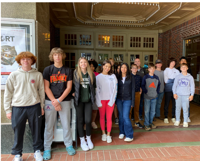
Students from Greene County Technical Education Center