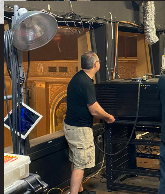
Above: The projector in its new home in the Paramount production room!