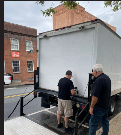
Left: Unloading the projector behind the Theater.

Getting it into the projection booth was no easy task, either. After being driven down from Washington, D.C., it was brought inside and up to the fifth floor before navigating narrow hallways and doorways with a total of seven handlers slowly, but surely, using muscle and might to get it perfectly positioned.