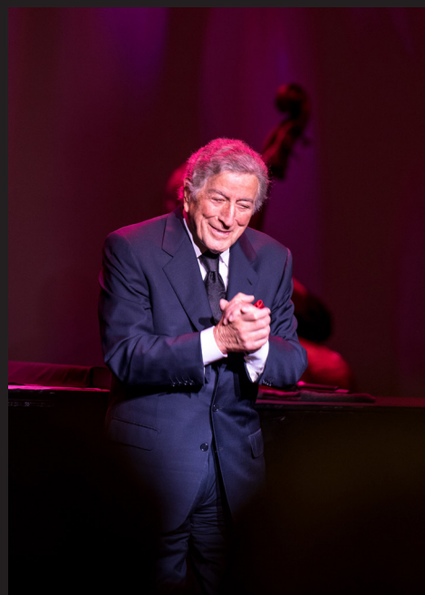
Above: Tony Bennett - December 12, 2016 Below: Diana Ross - February 5, 2015