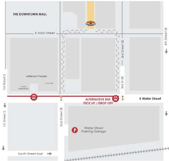
Water Street Drop Off / Pick Up