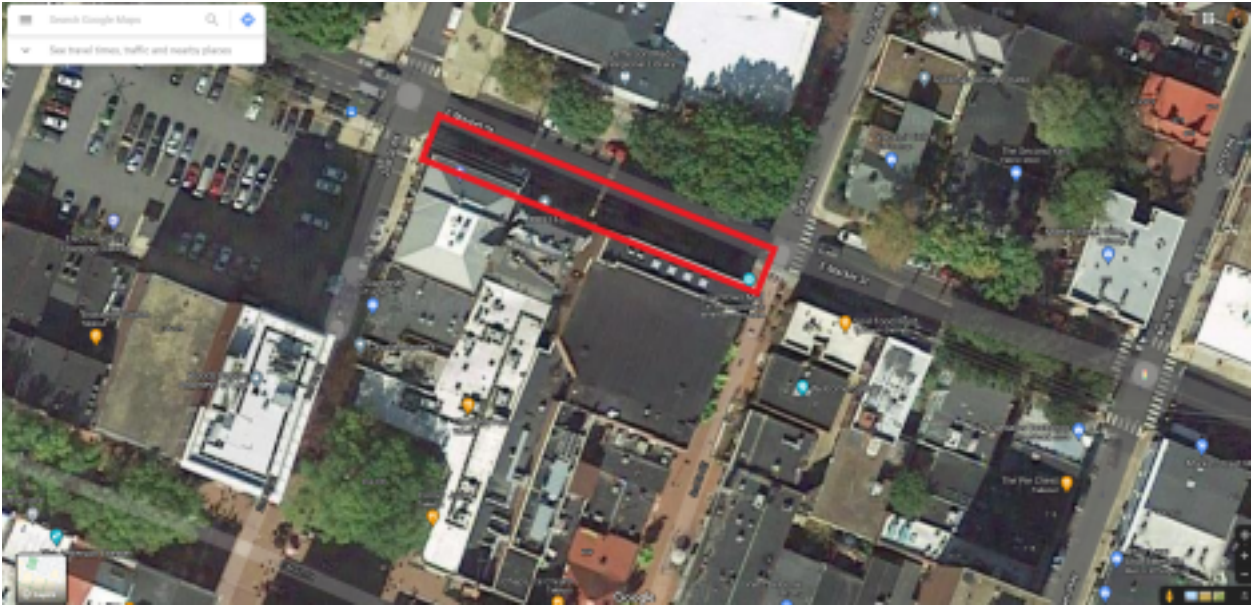
Overhead view of parking area

Parking area and loading dock are located at 204 East Market Street, Charlottesville, VA 22902.