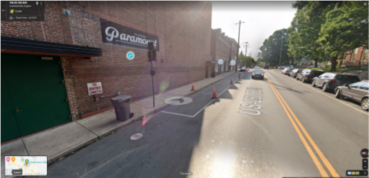
Street View of Parking Area